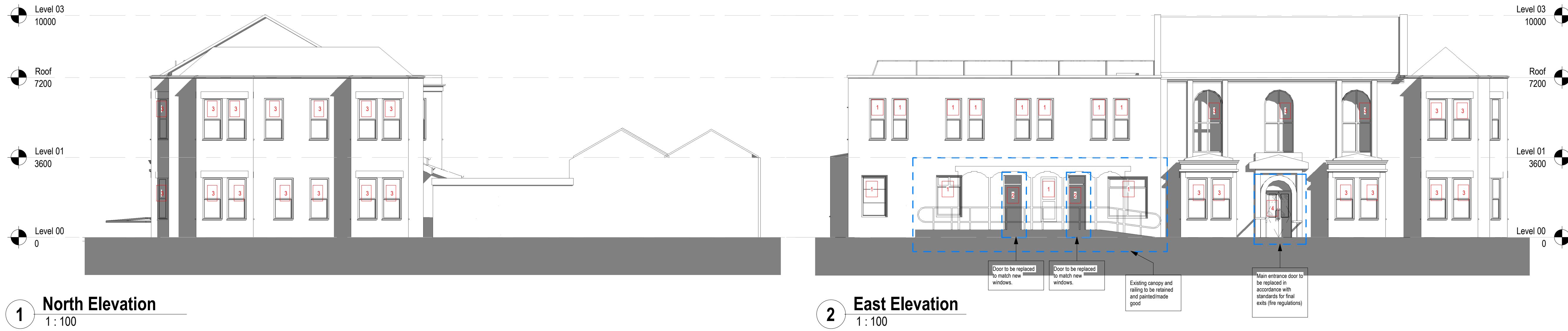
1 North Elevation 1 : 100